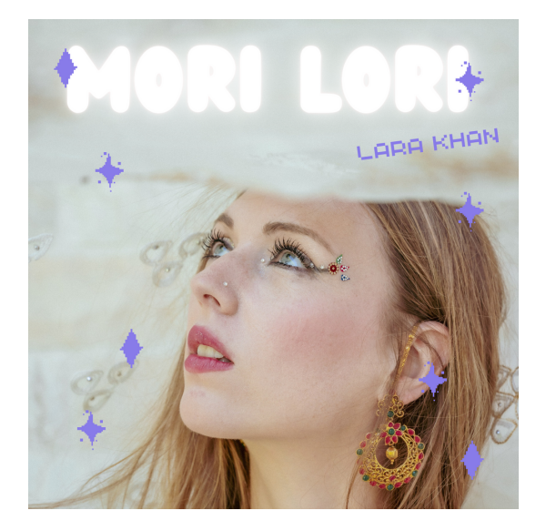
RELEASED ON DECEMBER 22, 2022

A song, with the significant subtitle: My Indian Heart.